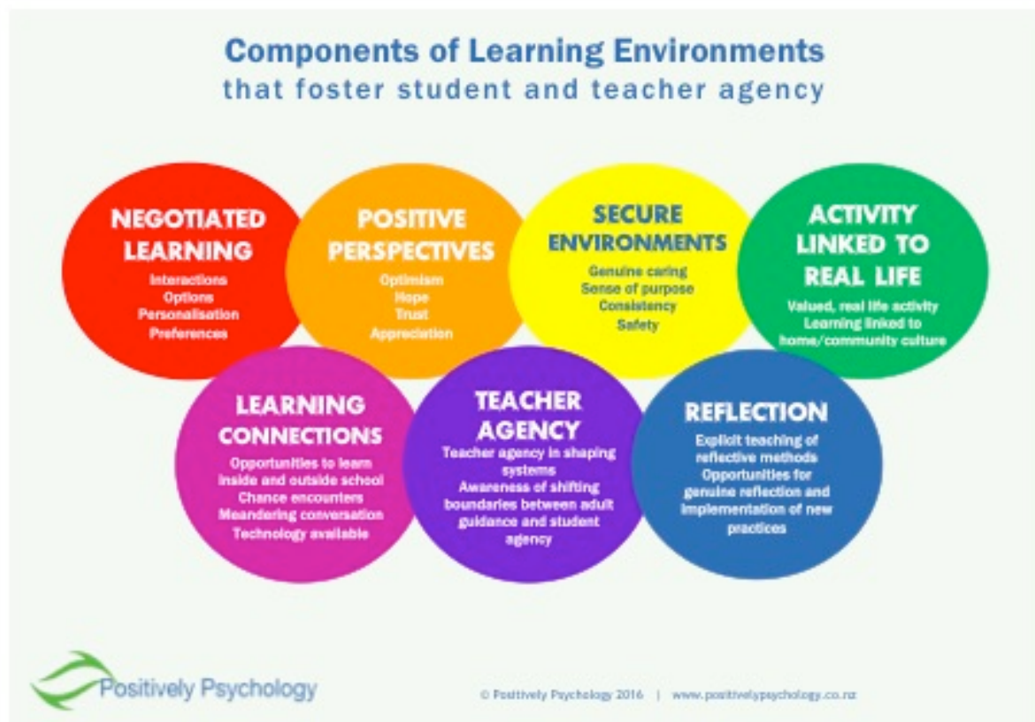
Figure 2. Teaching practices that support student agency (Annan, 2016).

The review of contemporary publications indicated that a range of teaching practices support student agency and these have been organised into seven emerging categories (Annan, 2016). The seven categories are listed and outlined below (see Figure 2).